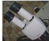
Leica Stereo Microscope, Germany (Option)