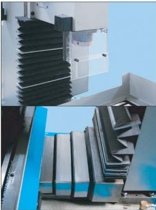
Fully Covered Bedways

4-th axis come ready to go, plug and play. Machine is covered and stand as well.