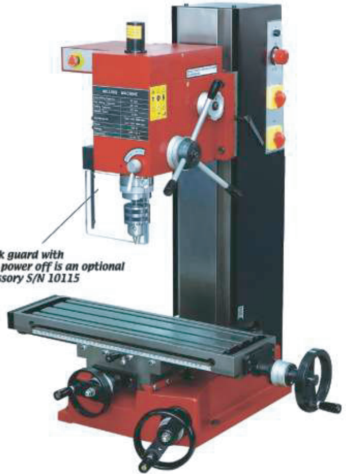
Chuck guard with auto power off is an optional accessory S/N 10115