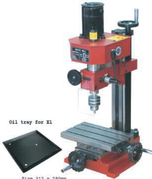
Oil tray for X1