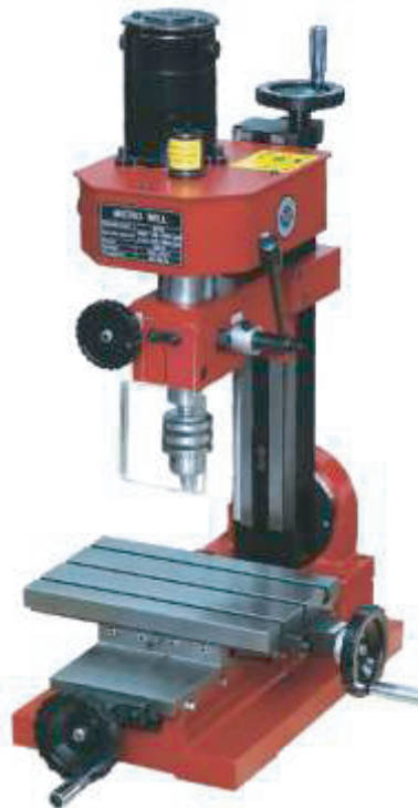
Oil tray for super X1