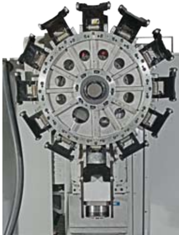
Fast tool change through automatic tool changer with turret type direct pick up

Dhruva variants HSTC 3035, HSTC 3050, HSTC 3070, HSTC 4050, and HSTC 4070