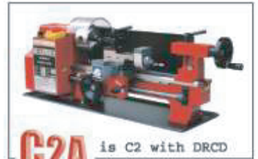
C2A is C2 with DRCD