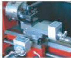
C2 or C3 owner, replace to DRCD by yourself.