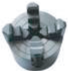
4-Jaw chuck Ø50mm independent self-centering