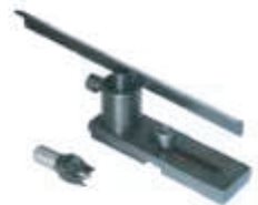
Wood tool rest with center