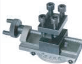
Angle cut rest